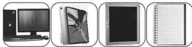
(a) (b) (c) (d)

(E) Which of the options represent a 'slate'?